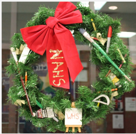
National Art Honor Society