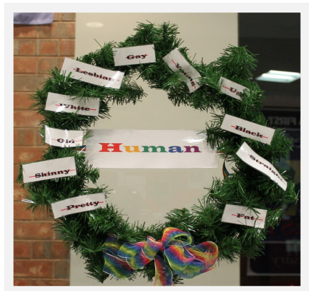
Gay/Straight Alliance Club