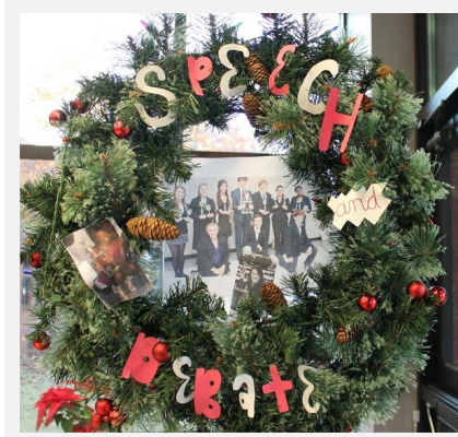
Speech and Debate