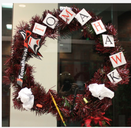
Tomahawk Literacy Magazine