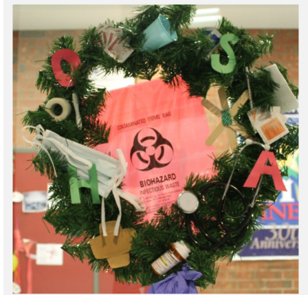
HOSA Health Occupations Club