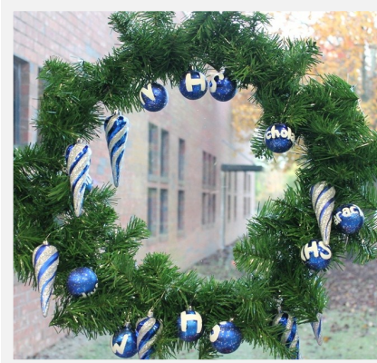
National Honor Society

.....More wreaths displayed in the atrium